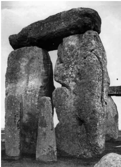
Figure 2 A trilithon: inner faces of stones 57 (smooth) and 58 (rough), with two bluestones at their feet

The small bluestones lie before the trilithons, at their feet (see Figure 2); they are precious in some way, transported with unbelievable effort from distant Wales, and re-arranged, ultimately, to form the innermost circle of the