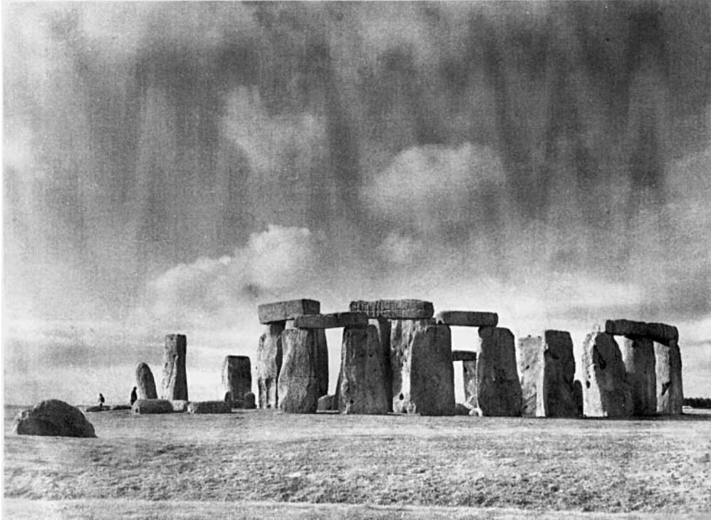
Figure 1 Stonehenge: a general view

The small bluestones lie before the trilithons, at their feet (see Figure 2); they are precious in some way, transported with unbelievable effort from distant Wales, and re-arranged, ultimately, to form the innermost circle of the